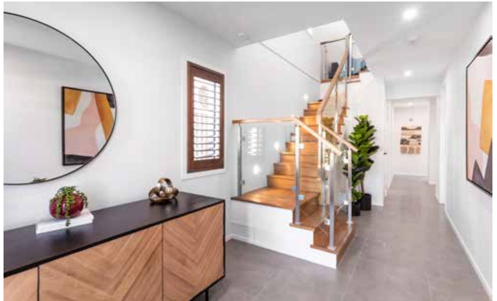
This image contains internal or external luxury upgrade items and furniture not included in the home price.